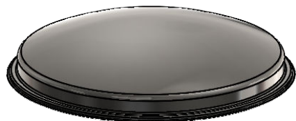
SCALE 1 : 12

UNLESS OTHERWISE SPECIFIED: 1. DO NOT SCALE DRAWING 2. DIMENSIONS ARE IN INCHES 3. TOLERANCE: FRACTIONAL ± .25 X.X ±.1 X.XX ±.03 X.XXX ±.010 ANGULAR: ±2 DEG. 4. INTERPRET DRAWING PER ASME-Y14.5M-1994 STANDARDS 5. THIRD ANGLE PROJECTION 6. REMOVE BURRS & BREAK ALL SHARP EDGES WITH R0.03 ±.02