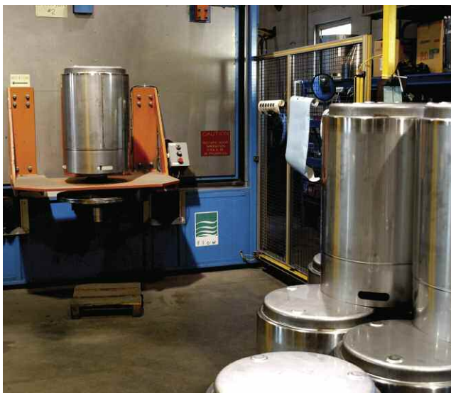
Among TMS’s standard product lines are these heavy-duty waste receptacles, fabricated from 16-gauge stainless steel, shown here awaiting finishing in a robotic cell.

Called on to rescue TMS from its press-control crisis and restore order to its lean processes: Toledo Integrated Systems, Toledo, OH. In 2010, Toledo Integrated replaced the existing operator screens and PLC controls on both of TMS’s hydraulic presses, including all distributed I/O. Out with the old, in with the